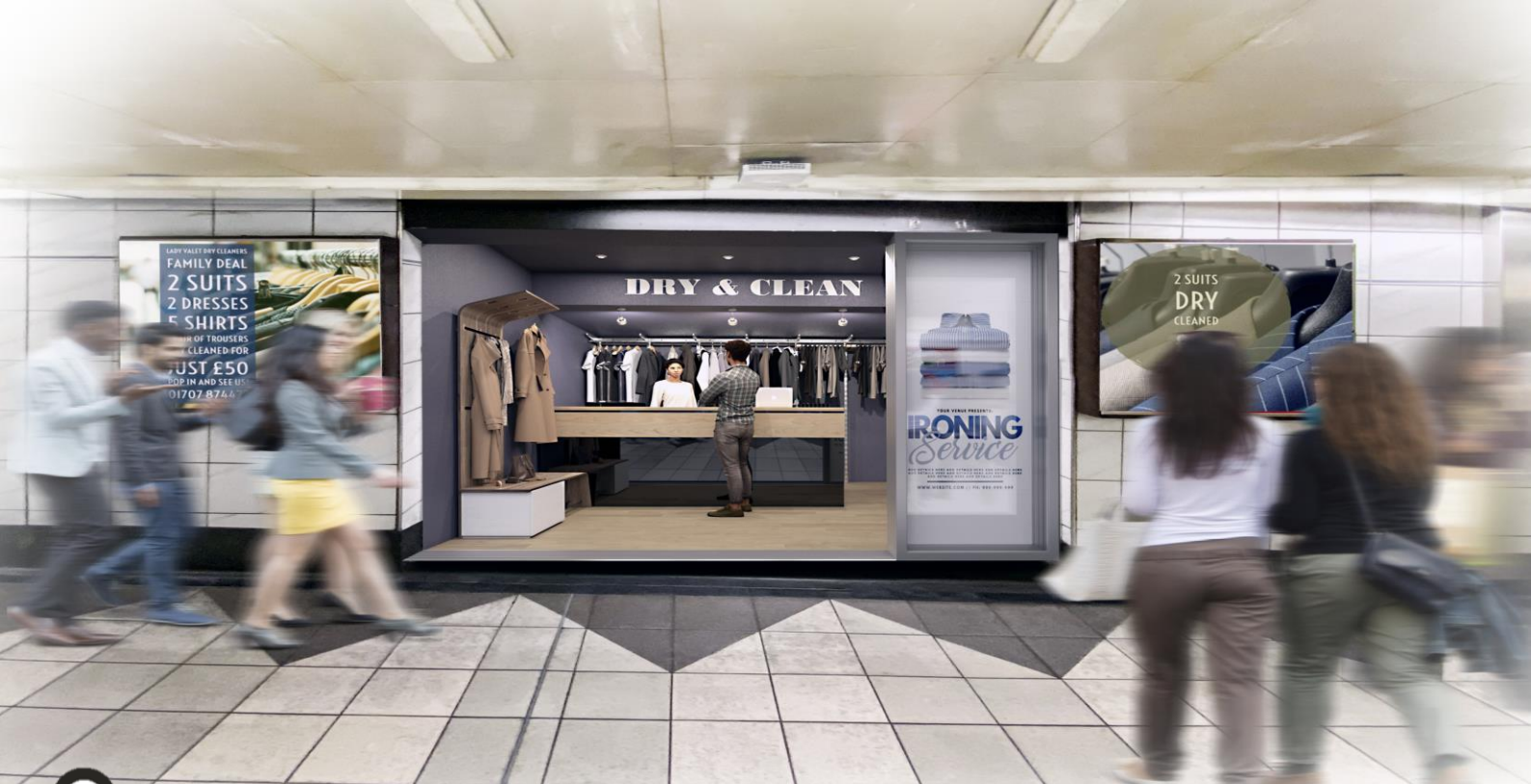
Shop 1 – Bank Station