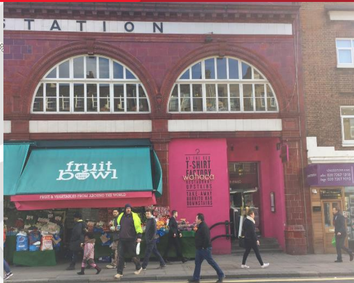
The above image is an example of what has been done with similar space at Kentish Town Station.